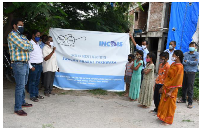
Photo-1. Awareness campaign against Plastic pollution hazards at INCOIS neighbourhood areas.