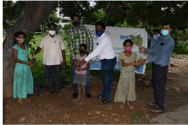
Photo-2. Saplings distribution at INCOIS neighbourhood areas.

In addition, an essay design competition for INCOIS employee’s children was also conducted with theme of Plastic pollution hazards. A total of two entries were received for this competition. Both the essays are shown in Photo-3. The activities were carried out with minimal physical gathering keeping in mind all the instructions and guidelines issued by the M/o Home Affairs and M/o Health and Family Welfare in current Covid-19 pandemic.